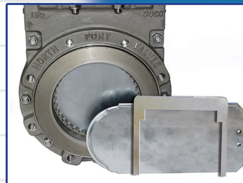
Factory replaceable – hardened gate, cartridge and guide for extremely abrasive conditions

DUFRENE AND COMPANY, LLC EXCLUSIVE AGENT/NORTH PORT VALVES