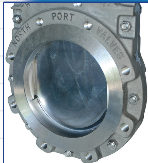
Outlet of the Valve