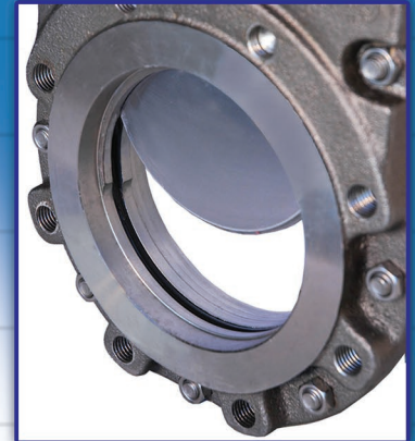
Full port, perimeter seat